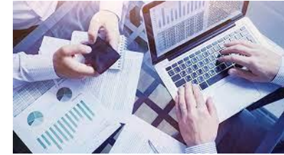
FINANCE AND INSURANCE